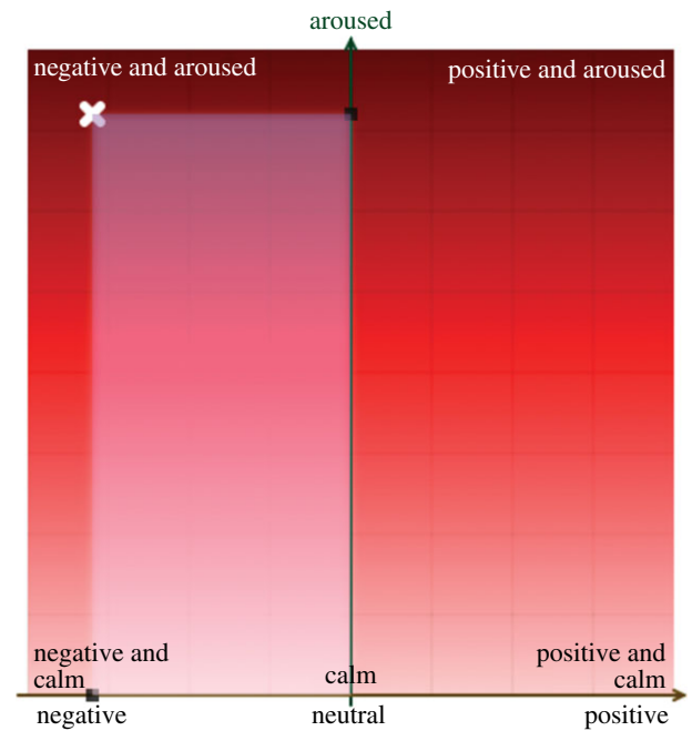
Figure 1. Two-dimensional response plane. x - and y -axes represent emotional valence and emotional intensity, respectively. The system projects the cursor's position to both axes (opaque area) to visually help the subjects to rate stimuli along both dimensions at the same time. The white X shows where the subject clicked to rate the actual sound. (Online version in colour.)

A novel online-based survey ( http://www.inflab.bme.hu/~viktor/sr_demo/ ) was developed to assess how humans perceive the emotional content of vocalizations. Instead of using